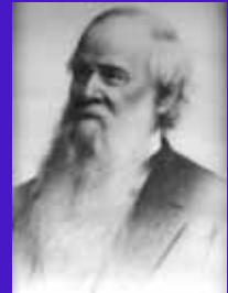
Henry Barnard was inducted into the Rhode Island Heritage Hall of Fame in December 2001.