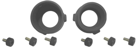
2 Adapters (28mm & 34mm) and 6 Screws